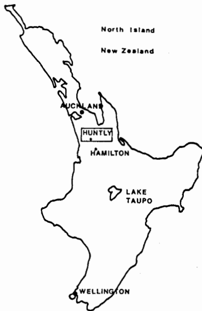
FIGURE 1. LOCALITY PLAN.

The Coal Corporation of New Zealand Ltd is New Zealand's largest coal producer, having recently acquired extensive reserves previously managed by State Coal Mines in both the North and South Islands. Operations in the North Island are centred on Huntly (Fig.1), a town in the Waikato region with a population of approximately 7,500 people. The Waikato region is noted for farming, horticulture, coal mining and its lakes and wetlands. The region is dominated by the Waikato River, which flows from Lake Taupo, discharging to the Tasman Sea at Raglan.