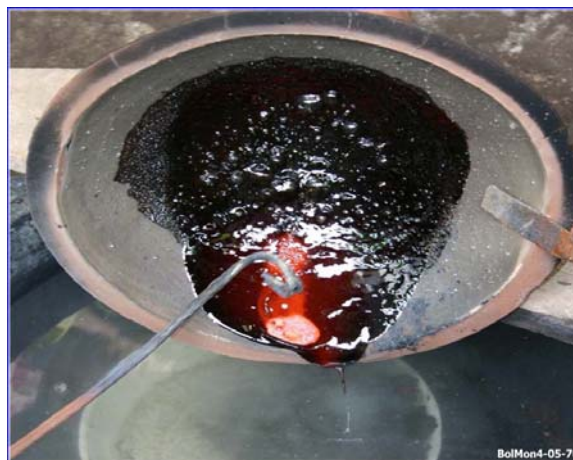
Figure 13. Gold button recovered after heating. Workers in this setting have the maximum contact with Hg vapors, and thus are most susceptible to Hg poisoning.

Initial tailings management was good at most trommel sites because they were collected and put into bags for reprocessing (Fig. 14). Final tailings disposal was not managed so well and many tailings found their way into the adjacent streams and rivers along resulting in substantial amounts of Hg there (Fig. 15).