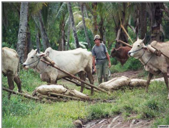
Figure 6. Oxen transporting sacks of ore to processing operation. Tatelu District.

Gold ore is hauled in 40 kg sacks (Fig. 6) to local trommel operations where it is crushed and processed. Smaller operations employ families to manually crush the ore; these crushers place cobs of uncrushed ore within a circle of rubberized material secured with to a wooden handle, and hammer it to coarse sand (Fig. 7; Fig. 8). Larger operations use a primary jaw crusher and a stamp mill (Fig. 9).