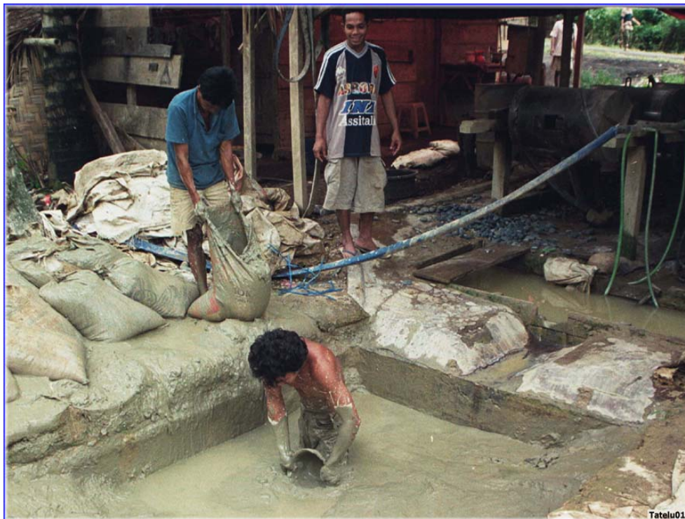
Figure 19. Recovering Hg-treated tails for Hg re-processing or cyanidation. Protective equipment is rarely available. Workers who are exposed to Hg contact in settings like these may limit their health or life span significantly through dermal contact alone.

in uncontained dumps and ultimately find their way to the soil, plants and streams. In addition to the health and environmental benefits, these changes would also reduce reagent costs.