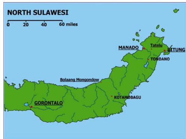
Figures 2 and 3. Regional maps of Indonesia