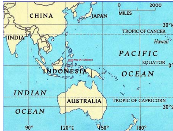
Figure 1. Regional Map: Indonesia is an archipelago of 17,508 islands (6,000 inhabited) [CIA World Fact Book- Indonesia 2005] and is part of the notorious Pacific "Ring of Fire." It has the world's largest number of active volcanoes of which 80 of 129 active volcanoes have erupted since 1600. [Directorate of Vulcanology and Hazard Mitigation, Ministry of Energy and Mineral Resources, Indonesia]