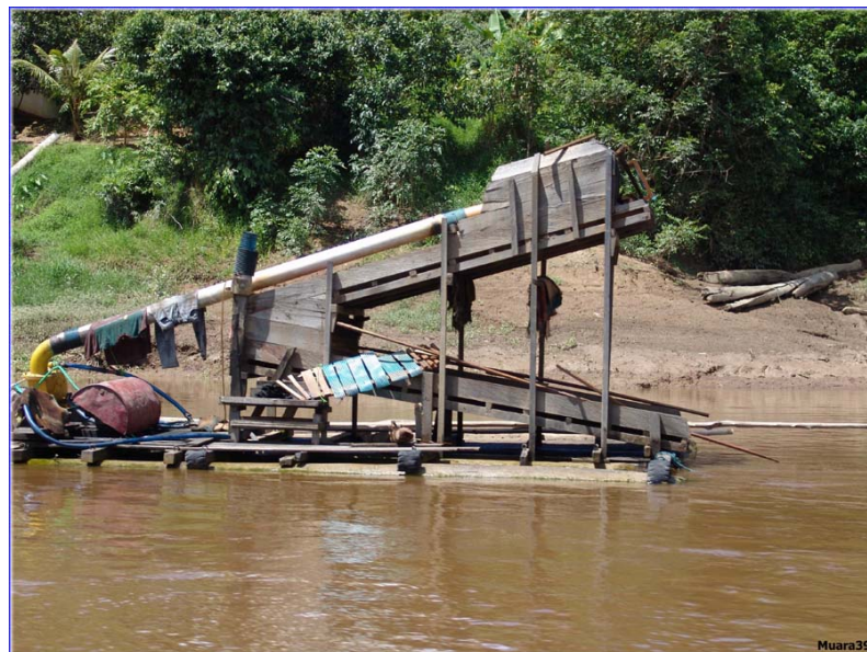
Figure 16. A suction dredge and sluice (tilted portions) recover free Au by gravity separation. Gold and other heavy minerals will be amalgamated and roasted to free the Hg. Barito River, Central Kalimantan.

While this paper focuses primarily on Hg processing at vein Au deposits in North Sulawesi, it seems useful to record what we know about Au production in other areas of Indonesia. Mercury amalgamation is apparently in common use to recover Au from alluvial placers (Fig. 16) and colluvial placers (Figs. 17, 18) particularly in central Kalimantan (Borneo). In addition, there are significant sized trommel operations on Sumatra, some containing up to 75 trommel units. While we know little about the degree of environmental releases from these operations, it seems clear that Hg amalgamation is practiced and that environmental releases probably are similar in magnitude to those in North Sulawesi.