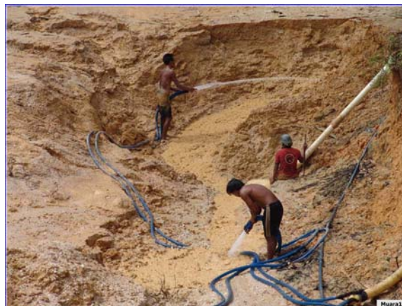
Figure 18. Hydraulic mining. A jet of water is sprayed at the loose sediment to expose Au bearing units. Valuable units will be run through sluice boxes to recover Au and heavy minerals.