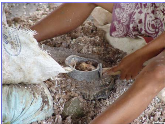
Figure 8. Ore is held inside a ring of conveyor belt material attached to a handle and crushed by hand with a hammer.