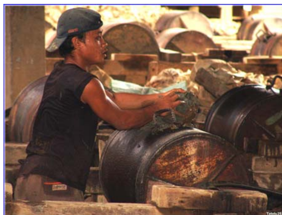
Figure 11. A worker loads ore for a second (or more) pass at crushing. If the crushed ore contains Hg, the workers' skin is exposed to it, especially through cuts or abrasions.