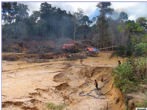
Figure 17. Gold is recovered from colluvium or paleo placers using hydraulic mining techniques. This technique releases massive amounts of sediment to streams and causes erosion and mass wasting.