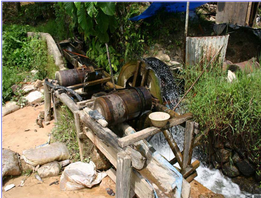
Figure 4. Water powered trommels, Pasaman, West Sumatra. A water wheel is used to turn two trommels in this set up.

Mercury amalgamation likely dates to Roman times and is one of the oldest methods of extracting Au from its ores. Amalgamation of Au ores described by Georgius Agricola in De Re Metallica in 1556 is essentially the same as present day practices. Use of wooden water wheels in Pasaman, West Sumatra, to power small mills would be very familiar to Au miners of the 1500's (Fig. 4).