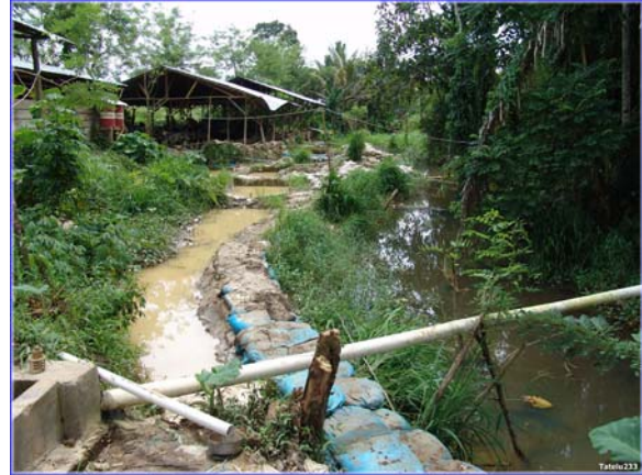
Figure 15. Tailings ponds by a stream.