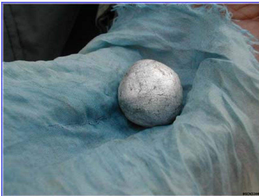
Figure 5. Gold-mercury amalgam after excess mercury and water has been squeezed through a dense cloth. This amalgam will be heated to drive off the mercury, leaving a button of Au.