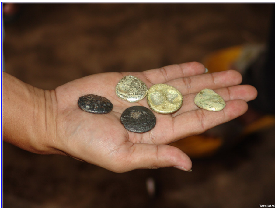
Figure 20. The yellow-gold buttons contain mostly Au, according to the Au buyers. The black buttons contain high Ag in addition to Au. The more valuable Au buttons were produced directly from Hg amalgamation. The Ag- Au buttons were produced by cyanidation. Because cyanidation recovers both Au and Ag more efficiently than amalgamation, it maximizes resource recovery. However, Au buttons command a higher price and thus may inhibit the switch from Hg amalgamation to cyanidation alone.

However, beneficiation efficiency is greater when particle sizes are below a certain threshold diameter, approximately 0.15 mm.