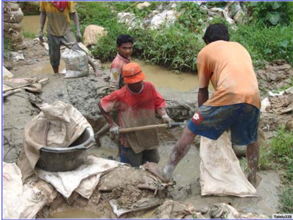
Figure 14. Bagging Hg-bearing tails.

on Manado's streets will buy bananas from Dimembe. Sadly, a long-term sustainable agricultural economy was replaced by a relatively short-term mining economy.