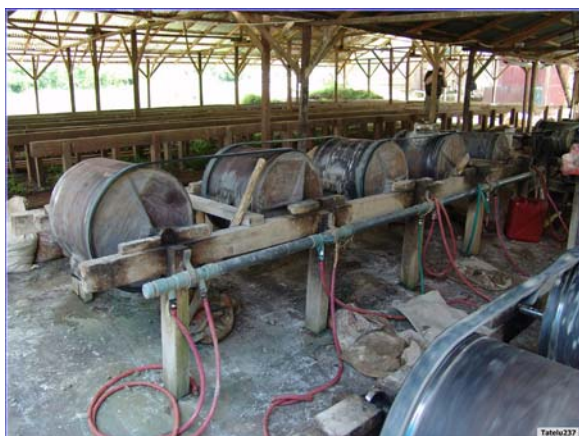
Figure 10. Trommel bank. Each drum, or trommel, holding about 20kg of ore is tumbled with river rocks for several hours. This autogenous grinding process is followed by further grinding with Hg to contact the Au with Hg to form an amalgam.

Crushed ore and river rocks are added to trommel drums and tumbled to further reduce particle size. Trommels are small ball mills or autogenous grinders. Each trommel unit contains 10 or 12 rotating drums (trommel), each with a capacity of about 130 liters (35 gallon) (Fig. 10). The drums are laid sideways and rotated with belts connected to a central motor. A single motor may run several trommel units. Each drum is charged with about 20 kg of crushed ore, washed rounded river rocks about softball size for milling balls, and water. This mixture is rotated for 3 to 4 hours, which crushes the ore to sub-sand sized particles releasing much of the free Au and associated metal oxides. Following this grinding step, \frac{1}{2} liter of Hg or more is added to each drum and the rotation continues for an additional half hour to create an amalgam of Hg and Au.