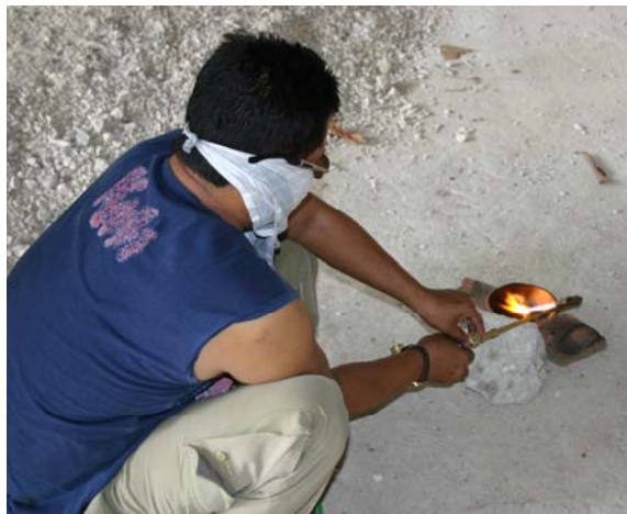
Figure 12. Amalgamated Au is heated with fluxes in an open clay or metal pot. The amalgam at this stage is unprotected, and Hg escapes to the open air.

Following amalgamation in the trommel, each drum is flooded with water to remove the clay and fine rock particles (Fig. 11) and the Hg / Au amalgam is recovered. The amalgam is then squeezed through a piece of umbrella cloth to separate the excess Hg, which is reused in other trommel batches. The remaining amalgam is then heated (ordinarily in an uncovered metal crucible in a non-vented area) using a blowtorch (Fig. 12) and Au is recovered (Fig. 13). Several small retorts were observed but all were unusable due to warping from overheating.