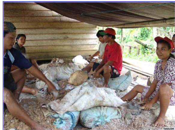
Figure 7. Community of workers using hammers to crush ore; Tatelu district.