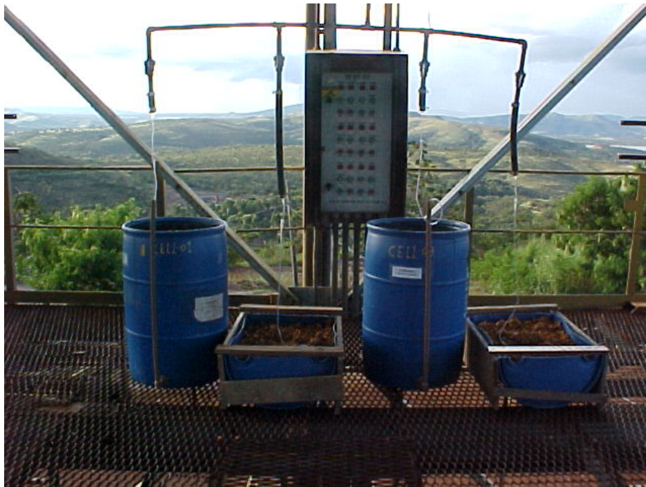
Figure 2. The first series of cells at RPM. The anaerobic Cell 1 is on the left.