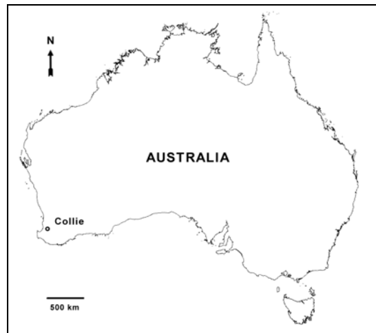
Figure 1. Location of pit lakes sampled in Collie, Western Australia

Measurements of dissolved oxygen ( \text{mg L}^{-1} ), pH, oxidation reduction potential (ORP, Ag/AgCl reference), specific conductance, chlorophyll a , turbidity and temperature were made in 2005 with a Hydrolab Datasonde 4a multi-parameter probe. In each lake, a pooled sample of surface water was taken and filtered through 0.5 \mu\text{m} glassfibre filter paper (Pall Corporation Metrigard™). Filtered samples were acidified and analysed by Inductively Coupled Plasma Atomic Emission Spectrophotometry (ICP-AES) for Al, As, B, Ca, Cd, Cr, Co, Cu, Fe, Pb, Mg, Mn, Hg, Se, Si, Sn, and Zn.