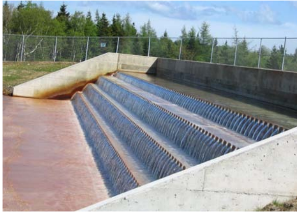
Figure 3 Neville Street Passive Treatment System aeration cascades

was installed to increase retention time by guiding the mine water leaving the cascades in a slow meandering pathway to the discharge. In September 2009, a bi-monthly mine water sampling program was set up to evaluate the effectiveness of the passive treatment system. Sampling points were established at the settling pond cascade inlet (CPI), the settling pond outlet (OSP), and the wetland outlet (OWL). Results to date have been encouraging with Fe at the settling pond CPI sampling location averaging 8.39 mg/L Fe, and the wetland discharge OWL sampling location averaging 0.67 mg/L Fe,