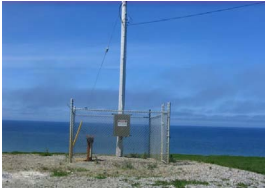
Figure 4 No.12/14 borehole outstation at the Atlantic Coast

With additional time before treatment was required, the Corporation decided to directly connect No.16 Colliery and No.12/14 Colliery with an inter-seam borehole. By April 2009 the borehole was completed and the New Waterford Mine Pool was created. This solution allowed for the combined mine waters from the two systems to mix and to be treated at only one location. In January 2010, a contract was signed with CBCL Limited to design/build a mine water treatment plant for the New Waterford Mine Pool to be commissioned by July 2011.