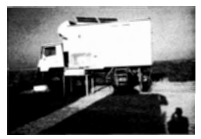
Figure 3. Mobil Laboratory on the Emergency Plant.

CHG divided the Entremuros surface in three areas