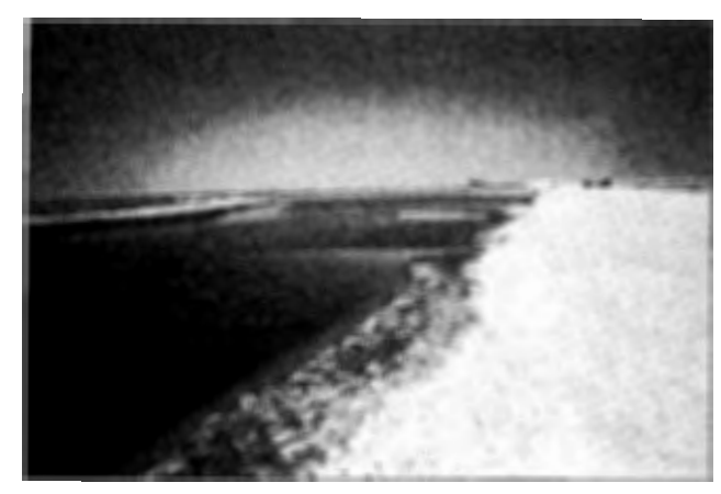
Figure 1. Sedimentation pond. On the bottom emergency plant.