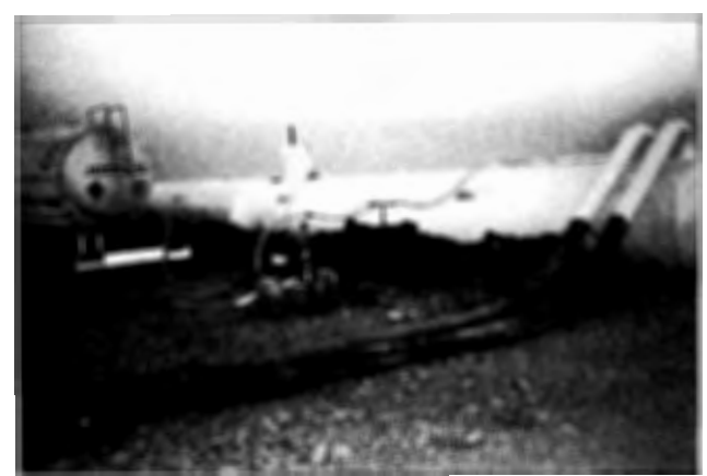
Figure 4. ITGE Emergency Plant.

AZNALCÓLLAR TAILINGS DAM ACCIDENT. PURIFICATION OF WATERS RETAINED IN ENTREMUROS