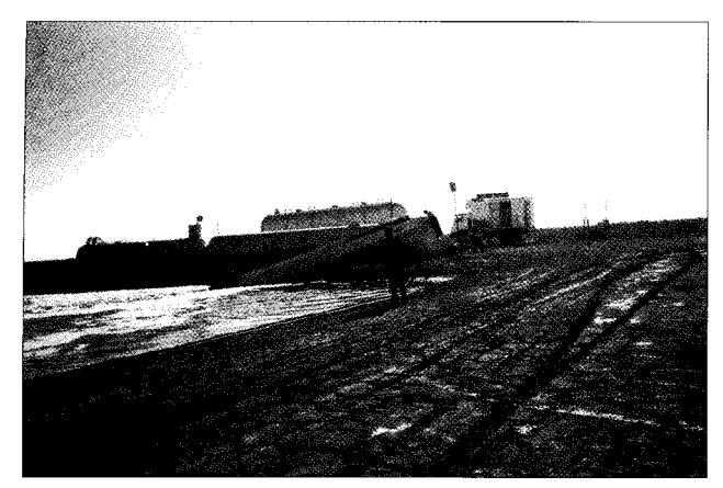
Figure 6. ITGE Emercency Plant and Mobil Laboratory.