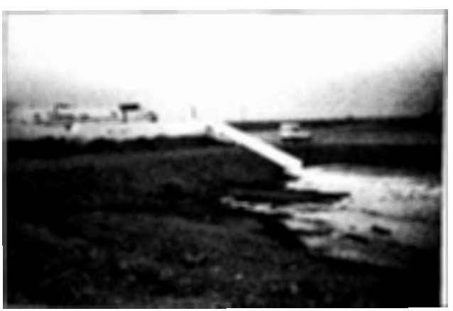
Figure 5. ITGE Emergency Plant.

The initial estimations about metal contents in the water to be treated have significantly diverted from the reality because the samples that have been analysed for the first tests were taken in the most polluted place, that is, near the south wall or the nearest wall to the purification pilot-plant. In the farest places from the referred wall and because of simple dilution, the quality improves gradually.