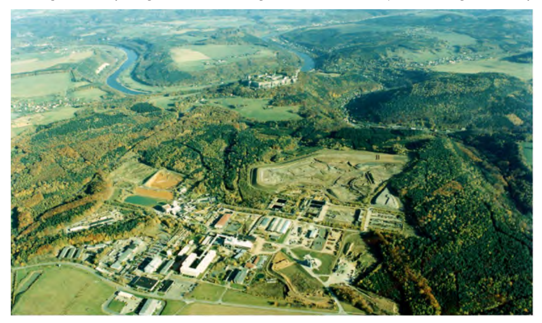
Figure 1 View of the Königstein mine site/Germany.

To date, the mine is in a partly flooded state. Some 4.5 million m<sup>3</sup> of a total volume of 11 million m<sup>3</sup> of mine voids subject to flooding are currently