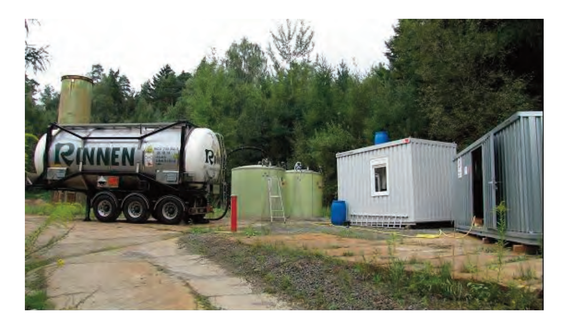
Figure 3 Mobile facility for producing and injection of reactive solution (left to right: mobile container for caustic soda, storage tanks, dose and station, moistening station).