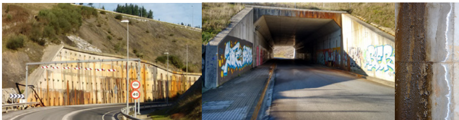
Figure 1 Anchor lines of a concrete retaining wall affected by corrosion (left) and ARD attack to precast concrete elements (right) along the newly-built AP-1 Highway. Guipuzkoa (Spain).

In these projects reutilisation of PAF material is normally not foreseen, mainly for environmental reasons, but also because of their poor mechanical properties: lack of bearing capacity, such as in sulphide-enriched coastal plain soils; high swelling potential, due to the precipitation of ettringite/thaumasite; poor durability, due to a quick weathering. Furthermore, the acid leaching from PAF materials can affect the durability of reinforced concrete structures located in their proximity by leaching portlandite out of concrete and inducing cracking in it due to sulphate precipitation within the generated voids. Finally, the acid leachate can prompt corrosion in steel reinforcement bars and anchorages (fig. 1).