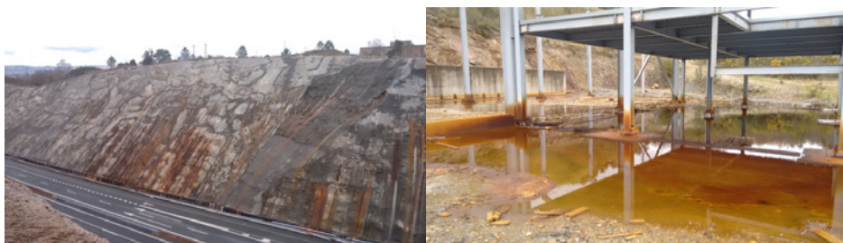
Figure 2 As Pontes road cut along AG-64 highway (left) and sampling area at the industrial site (right).