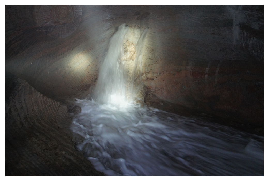
Figure 1 The brine in the operational development in the direction of the panel number 2.

Also, the brines contained in the lower part of the section of the super-salt rock can penetrate into the underground mine workings. Mining brine shows that have a