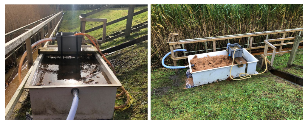
Figure 2 Coir R&D trial at Summersales Mine water treatment scheme, during installation and in operation.

MWTS (Greater Manchester) in November 2021, in a 1m<sup>3</sup> glass reinforced plastic tank. The Summersales MWTS consists of two pairs of aeration cascades and settlement ponds, in series, and a reed bed. Water for the R&D trial is captured from the effluent point of settlement pond 2, and conveyed to the trial via a siphon.