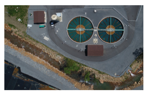
Figure 4 T & T AMD treatment plant

Total capital costs for the watershed-based approach are 15.9 million USD compared to a point source approach of 12.5 million USD. The Average operations and maintenance costs for the watershed-based approach is 530,000 USD/a. as opposed to the point source approach of 1 million USD/a. Though initial capital costs were more in the watershed-based approach the capital costs were substantially lower yielding savings over a 10-year period of over 1.2 million USD (Ziemkiewicz, 2023; Table 1). OSR also received 1.2 million USD for initial capital expenses from Southwest Energy (SWE). SWE also contributes 350,000 USD/a for the operations and maintenance costs for the project. SWE had no responsibility for the negative effects originating from Muddy Creek. They voluntarily to contributed to the project as a private industry partner with OSR.