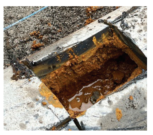
Figure 8 Iron accumulation in AMD pressurized line

pressure on the sludge pumps by reducing both the distance of the line and the elevation of the injection point. Currently, only one sludge line is being used. OSR is installing two sludge lines to the new locations. More efficient sludge disposal pumps are also being installed. This will increase the efficiency of the sludge disposal system.