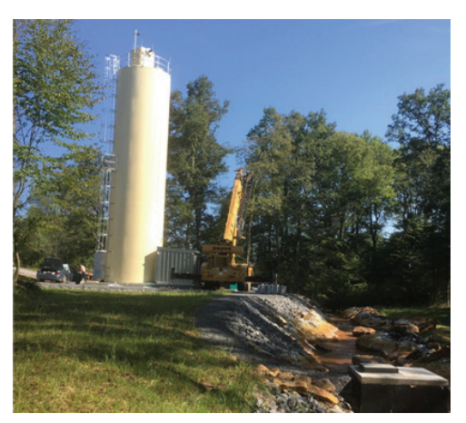
Figure 5 Glade Run doser with in-stream pH probe in the foreground right

Before treatment, in 2015, results from an electro-shock fish survey near the mouth of Muddy Creek showed no fish. In 2019, after treatment had begun, a survey detected 143 fish of nine different species (WAB May 2021). Fish species found at the mouth of Muddy Creek