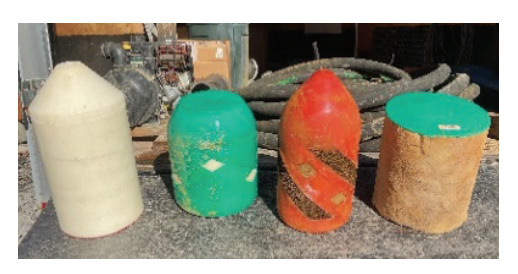
Figure 9 "Pigs" that are used to push through pressurized line to clean the line

As a result of the 2021 high flow event, OSR revisited the plant's sludge disposal system. OSR currently is finalizing land acquisition for the installation of a new sludge disposal line. The current disposal system injects the sludge from the T & T plant back into the mine. OSR's new location will reduce the head