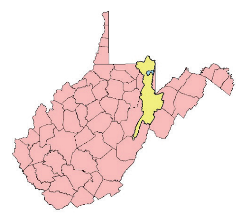
Figure 1 Cheat River Watershed in yellow with Muddy Creek Watershed in blue

The goal of restoring the Cheat River Watershed, even with treatment of AMD, was being attained. The money spent by OSR to treat Title 5 discharges was considered. OSR had been treating AMD discharges from T & T mining permits since 1995. T & T was the largest Title 5 contributor of AMD to Muddy Creek. From 1995 to 2014, OSR spent over 9 million USD on operational costs (Riggleman 2018). Despite these efforts, the treatment plant had to be replaced with new technologies and infrastructure to meet NPDES discharge limits. In addition to the T & T discharges, OSR had nine other treatment sites within the Muddy Creek Watershed, which had cost 3.4 million USD on capital and a total of 11.5 million USD on operation and maintenance from 1995 to 2014 (Sheehan & Ziemkiewicz 2017). OSR also had three other AMD treatment sites within the watershed that had yet to be constructed. This amount of money was that for treating only the Title 5